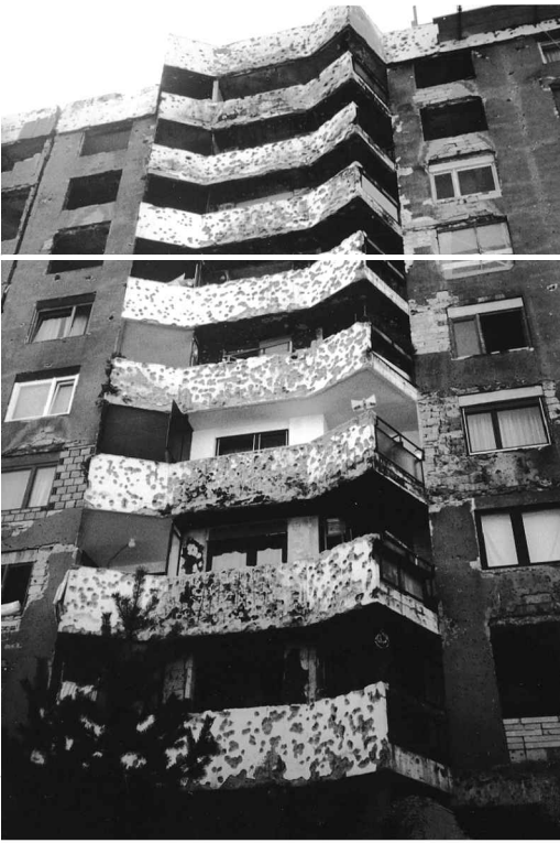
Figure 1 Sarajevo. At the frontline of the urban siege—Grbavica neighbourhood.

a parent of two young children, I would like to believe that I would rise above a contemporary struggle and pass along a brighter future for my children. Yet, this feels like a wish, not a genuine reaction. Are we perhaps mistaken to believe that pain and hatred should dissipate through the generations? Mistaken to believe that 40 years of Tito can dispel the pain and hatred experienced by Serbs, Croats and Muslims during World War II? Mistaken to believe that a decade of strong economic times in America can dispel the ethnic and racial tension that has existed in our cities? I must come to terms with my own gut reaction to what I hear and witness in the former Yugoslavia. If these terrible things were done to me and my family simply because of my ethnic identity, the most important task in my remaining life would be to tell my impressionable and curious son and daughter exactly what was done to me and by whom.