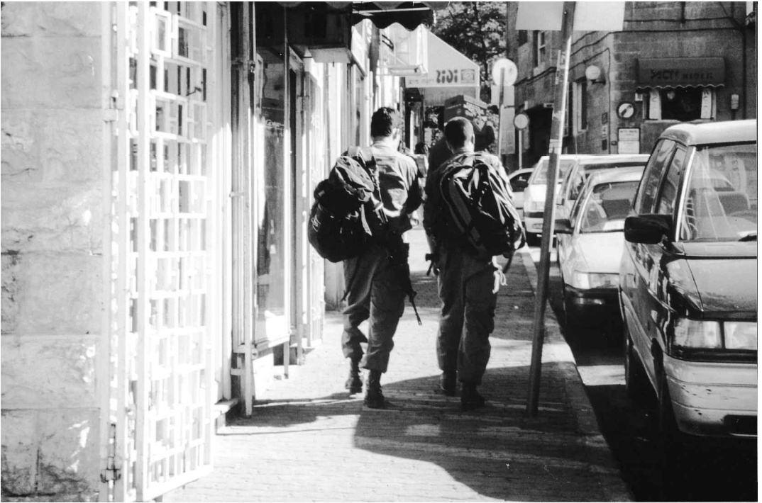
Figure 6 Jerusalem. A common sight in west Jerusalem—Israeli army soldiers.

border, meant to separate peoples, actually draws the two sides closer in space due to land use competition over Jerusalem. Borders in contested cities illuminate a strange world of separateness and connection; or in the words of Meron Benvenisti, the existence of ‘intimate enemies’.