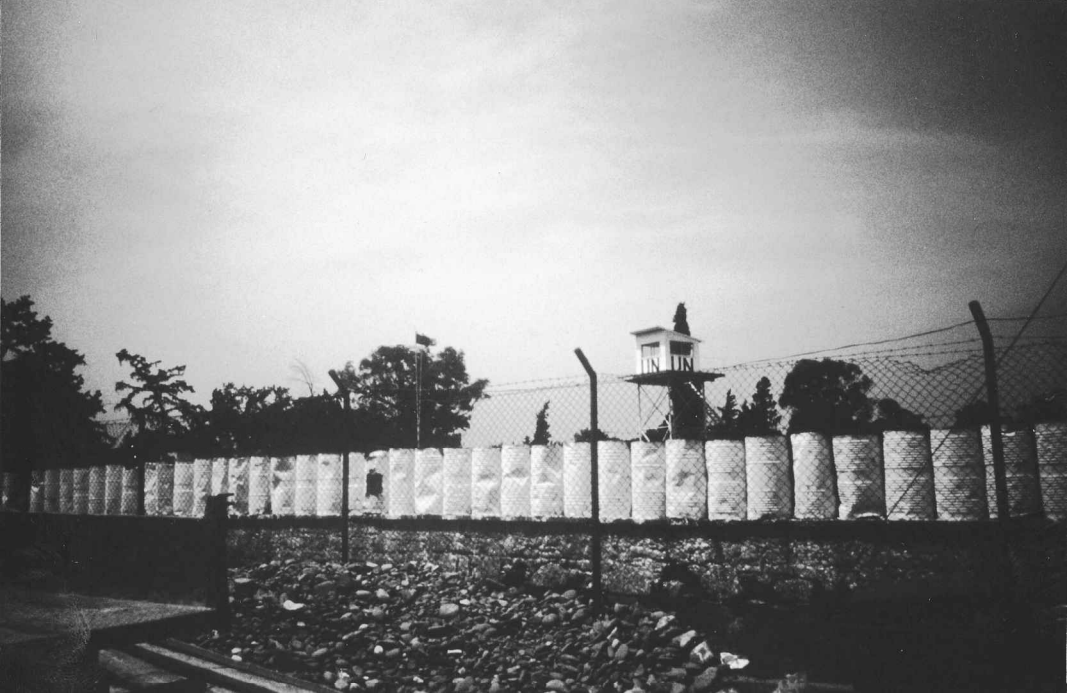
Figure 7 Nicosia. Looking north from Turkish Cypriot side at the buffer zone.