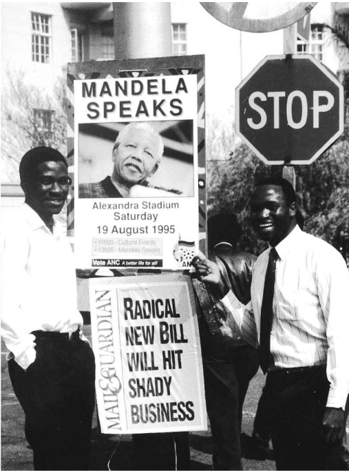
Figure 3 Johannesburg. Louis Botha Avenue 1995.