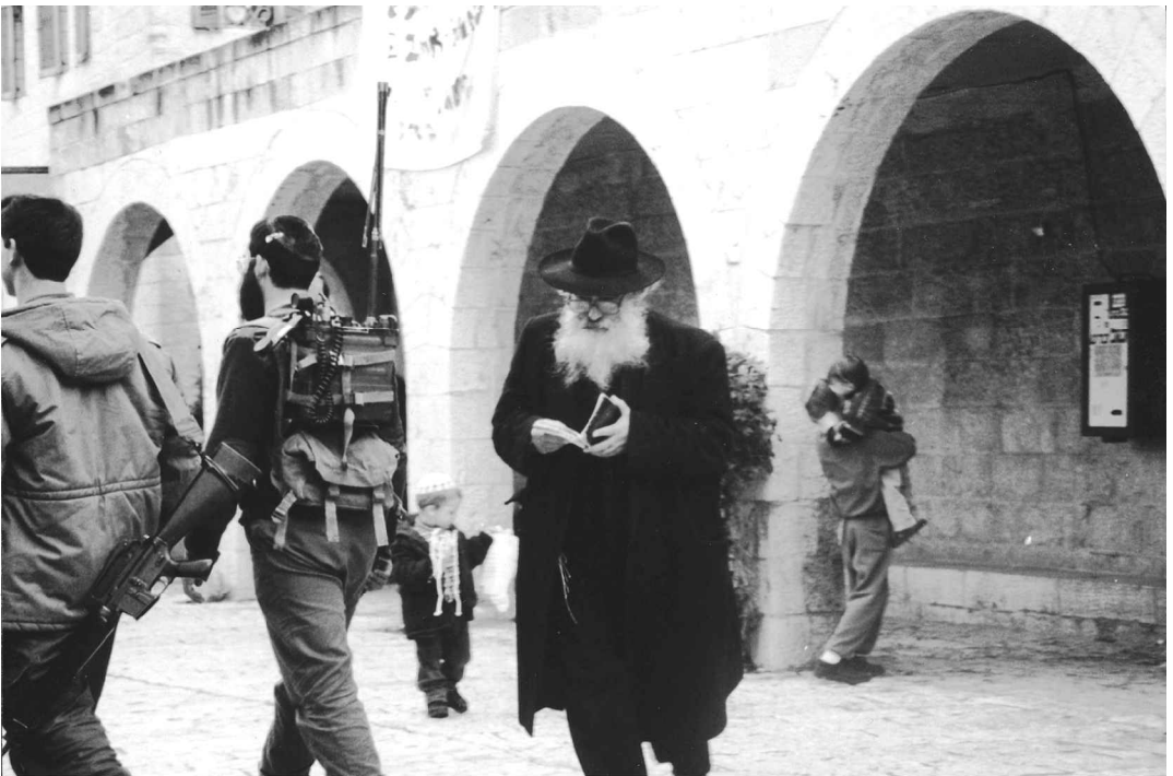
Figure 5 Jerusalem. Jewish Quarter in Old City—Israeli army soldiers and orthodox Jew.

A common, defining, characteristic of divided cities is the significant presence of borders—real and perceptual. Competition for land and territory in contested cities creates the need for politically constructed boundaries and borders which separate ethnic groups. These boundaries separate people but paradoxically bring them together. Political lines demarcate ownership amidst contested space, but also can become places of encounter due to the same competition that spawned the borders in the first place. In the Damascus Gate ‘seam area’ in Jerusalem, Arab labour and trucks now establish themselves there looking for Jewish construction jobs. Outside the 1967 outer boundary of Israeli-defined Jerusalem is the burgeoning Arab settlement of A-Ram, whose growth can be attributed to its ability to act as a safety net for Arabs unable to live in restricted Jerusalem. The Israeli-delineated